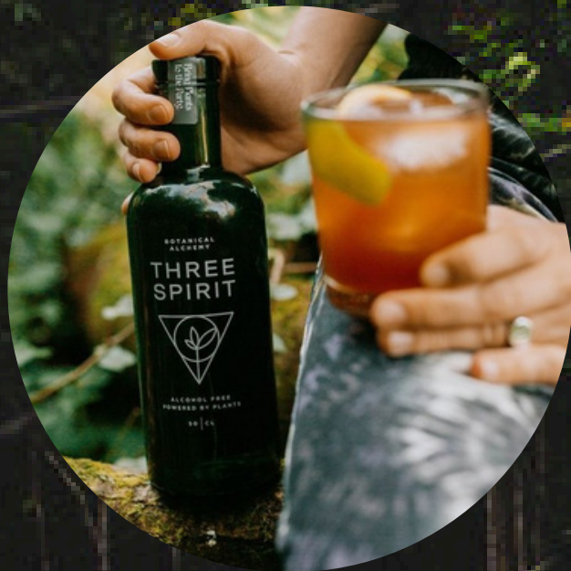
Outdoor Dining with Three Spirit

4 Days packed with challenges, adventures, gratitude, focus sessions