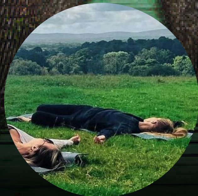
Surrounded by nature