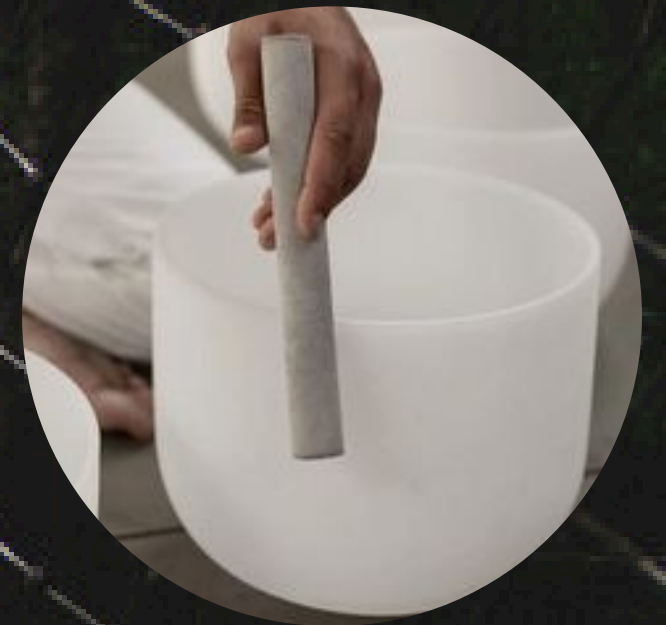
Sound Vibration Therapy